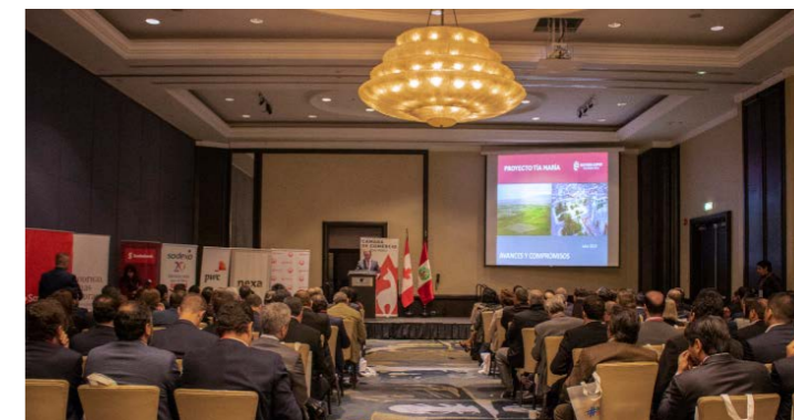
Networking Breakfast & Conference