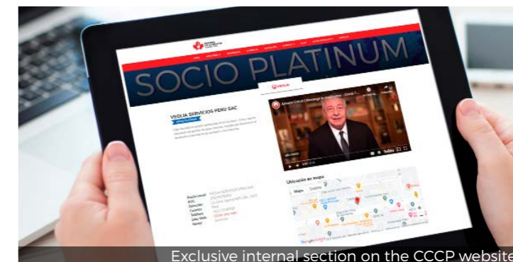
Exclusive internal section on the CCCP website

** ) The arts, promotional materials and inserts must be supplied by the partner according to the specifications of the CPCC..