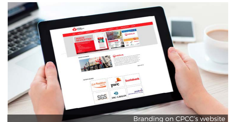
Branding on CPCC's website