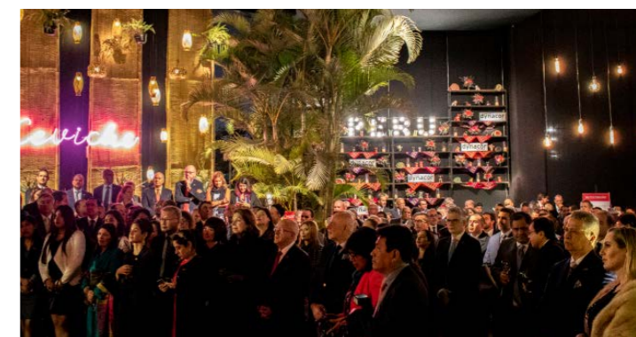
Canada Day - Cocktail