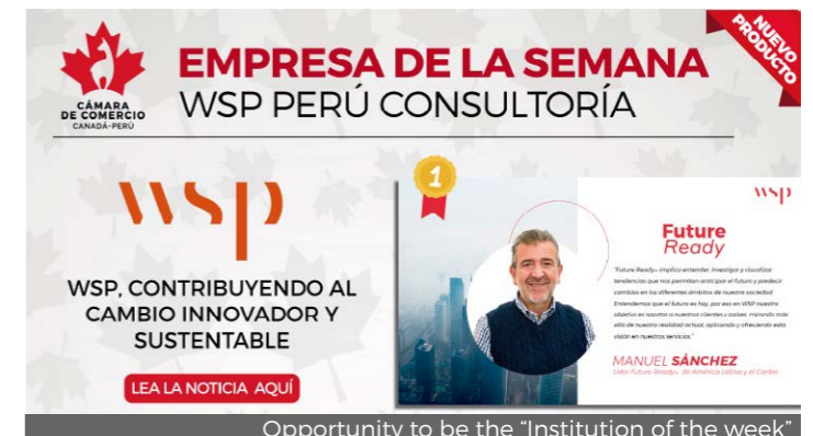
Opportunity to be the "Institution of the week"