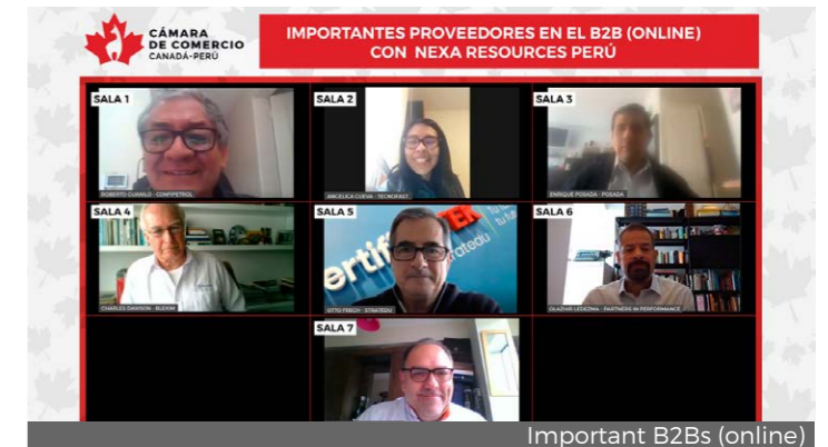
Important B2Bs (online)