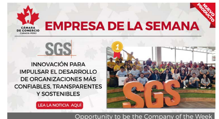
Opportunity to be the Company of the Week