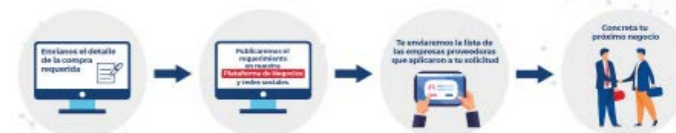
Bussiness Platform flyer