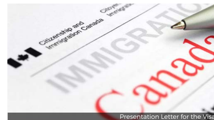
Presentation Letter for the Visa