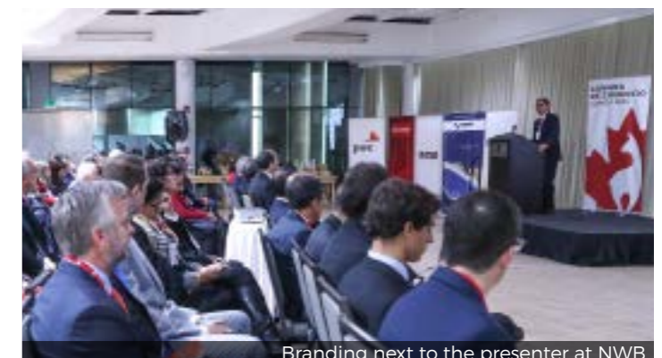
Branding next to the presenter at NWB