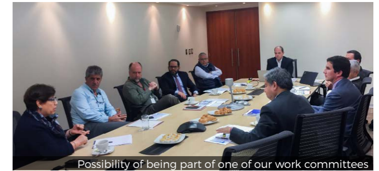
Possibility of being part of one of our work committees

(**) The arts, promotional materials and inserts must be supplied by the partner according to the specifications of the CPCC..