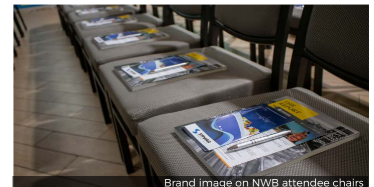
Brand image on NWB attendee chairs