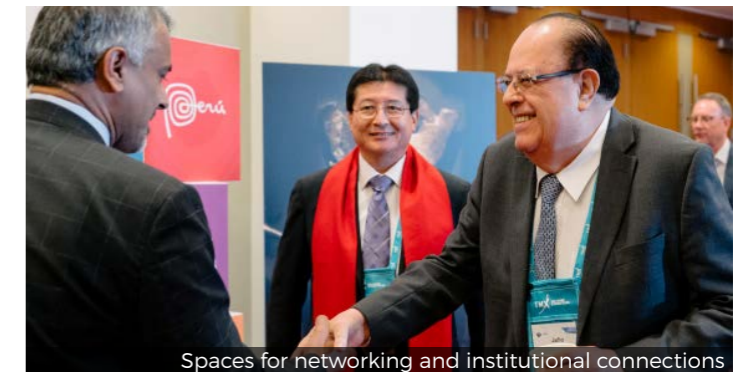
Spaces for networking and institutional connections

(**) The arts, promotional materials and inserts must be supplied by the partner according to the specifications of the CPCC