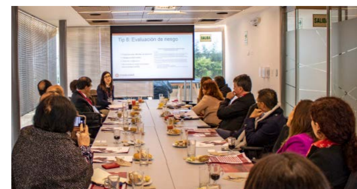
Have a coffee with...