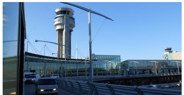
Toronto Pearson International Airport