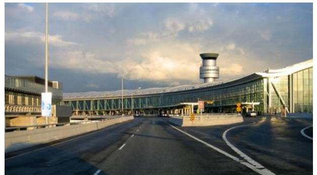
Toronto Pearson International Airport