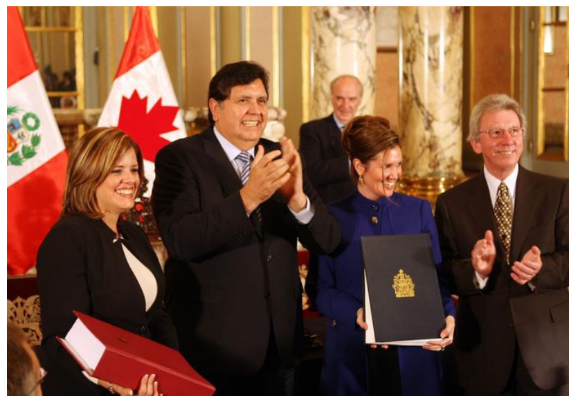
Signing of the Peru-Canada FTA on May 29th, 2008 during the term of office of the former President of the Republic of Peru, Alan García.